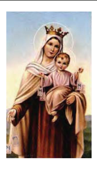
"The Seed that fell on good soil produced a hundredfold"